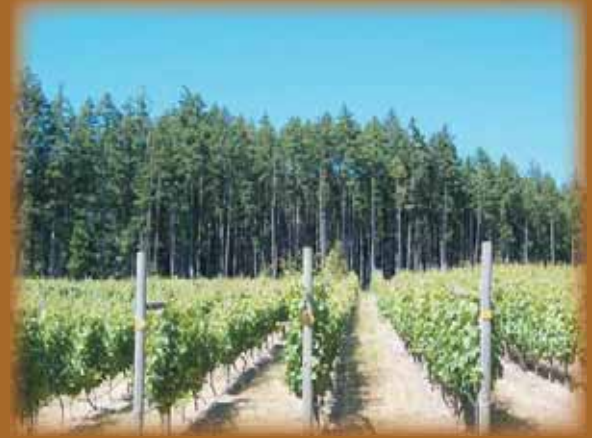
Enjoy the scenery at the award winning Cherry Point Vineyard