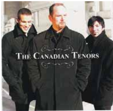
The Canadian Tenors - An eclectic repertoire showcasing the power and beauty of the human voice.