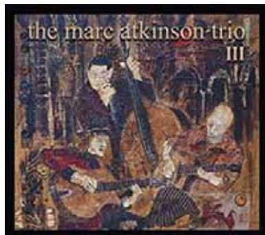
Marc Atkinson Trio III - Guitar-driven "gypsy jazz"; Montreal Jazz Festival favourites!